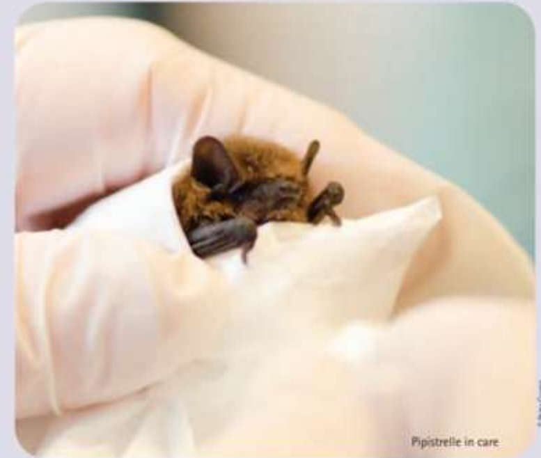
Pipistrelle in care.

Guidance on how to get involved with bat rehabilitation and the support available