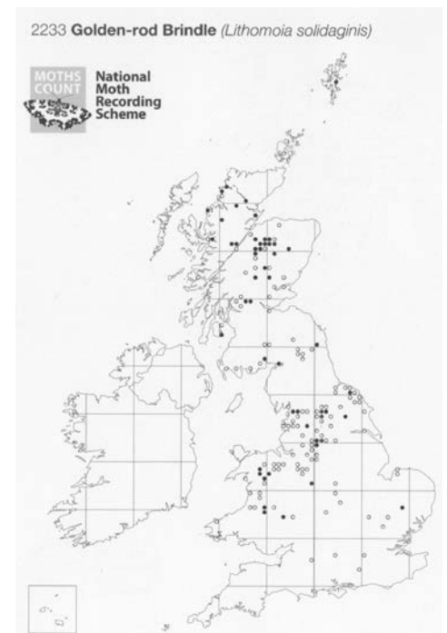
UK Distribution (NMRS 2010)

A new micromoth was added to the VC35 list during the same session on 30 th June when Pleurota bicostella came to light at Bal-Bach. This very distinctive white and brown moth is another moorland species, whose larvae feed on heather.