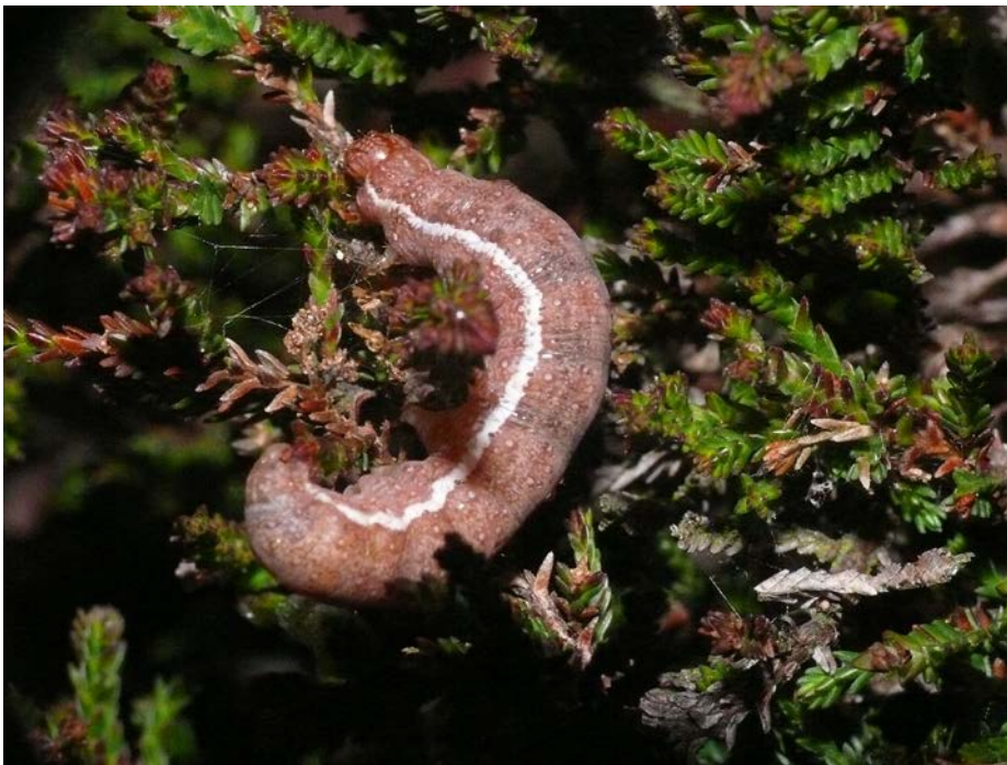
Golden-rod Brindle Caterpillar (Dave Grundy)

The previous evening, five of the larvae were found on Hatterall Ridge (SO3026), just the Herefordshire side of Offa's Dyke path, so the species is obviously breeding in the Black Mountains. It is mainly a northern moth, and as the map shows, these records extend its UK breeding range southwards. The old records from southern England are assumed to be one-off immigrants.