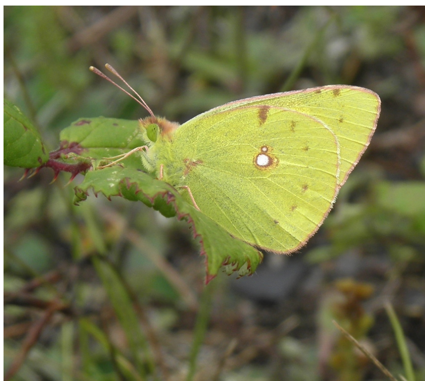
Clouded Yellow (Nick Felstead)