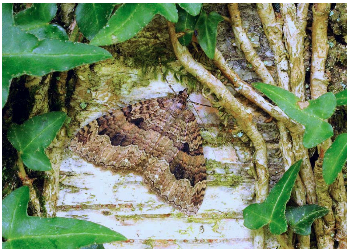
Tissue Moth