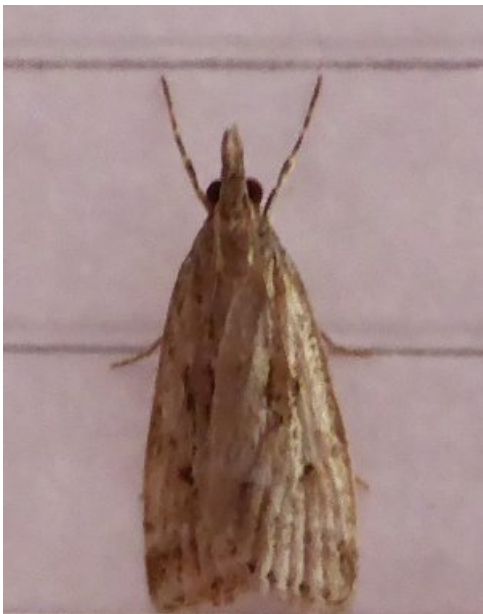
Eudonia pallida