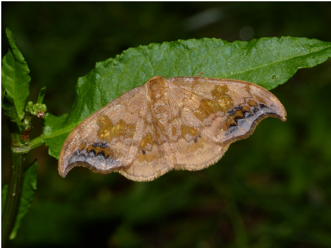
Scarce Hook-tip