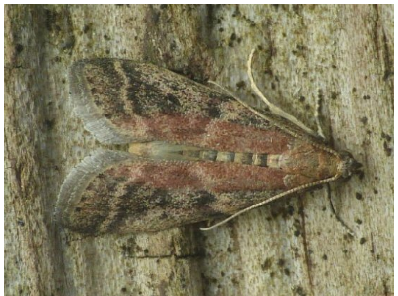
Ephestia parasitella